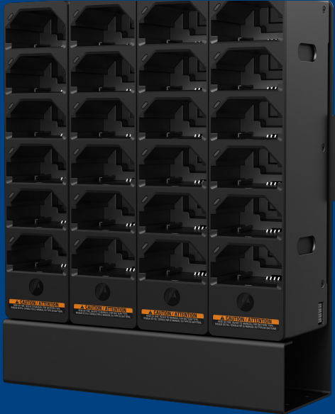
TETRA MODULAR CHARGER (MOUNTING KIT SOLD SEPARATELY)