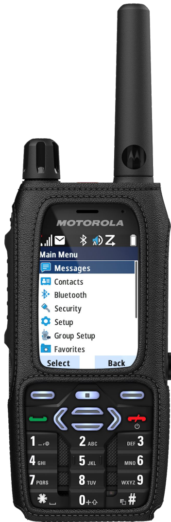
SOFT LEATHER CARRY CASE (RADIO SOLD SEPARATELY)

Whether the members of your team want to wear the radio on the shoulder, chest or hip – there's a carry accessory to meet their needs. Choose from a range of leather carry cases, straps, shoulder-wearing accessories and belt clips, all designed for easy yet secure access to the MXP600 radio - so your team can stay hands free and focused on the task ahead.