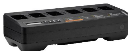
IMPRES 2 MULTI-UNIT CHARGER - 6 POCKET