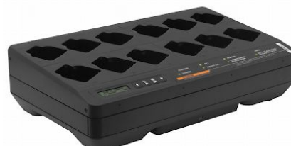
IMPRES 2 MULTI-UNIT CHARGER - 12 POCKET